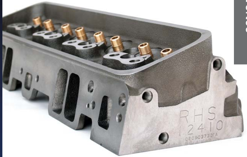
Dual bolt pattern (4 and 6-bolt) allows compatibility with both early-style SBC and GM Vortec intake manifolds.

Touring auctions and digging through junkyards for a good set of Vortec heads can get old. Pro Torker™ Vortec Heads are designed as a stock replacement for the popular GM 906 casting but flow far better and are much more powerful. RHS® patented Clean Cast Technology™ and close tolerance machining provide exceptional finish quality for superior performance and reliability, and the revised water jacket design helps prevent cracking commonly found in GM 906 factory castings. And when you add up the money you spend repairing and machining factory heads, these heads actually save you money – giving you maximum power for your performance dollar.